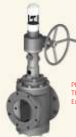
Plug Valve The Array Accuseal® Expanding Plug Valve