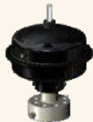
ADP Actuator Array Model APD Pneumatic Diaphragm Actuator

Array Holdings – Array is a Leading manufacturer and distributor of Gate Valves, Actuators, Fittings and other flow control products.