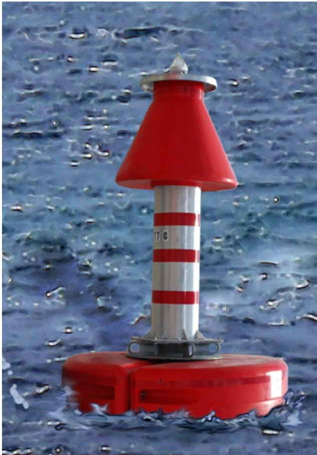
ESB - Essi Smart Buoy

The Essi Corporation Model ESB ( Essi Smart Buoy) is a durable, practically indestructible/ unsinkable, polyethylene buoy.